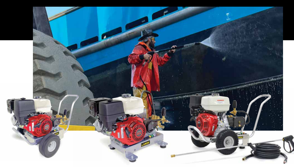
Belt-Drive HD Gas Cart

Compact and corrosion-resistant, the HD Gas aluminum pressure washers can be utilized as a cart or a skid (optional) for maximum cleaning versatility and durability. Easy to maneuver with puncture proof, flat free tires. These reliable Honda powered pressure washers offer a bypass loop for additional pump protection, as well as a 7-year warranty on the oil end of the pump. The simple design of the HD Gas helps get the job done quickly and without hassle. All models are ETL certified to UL safety standards.